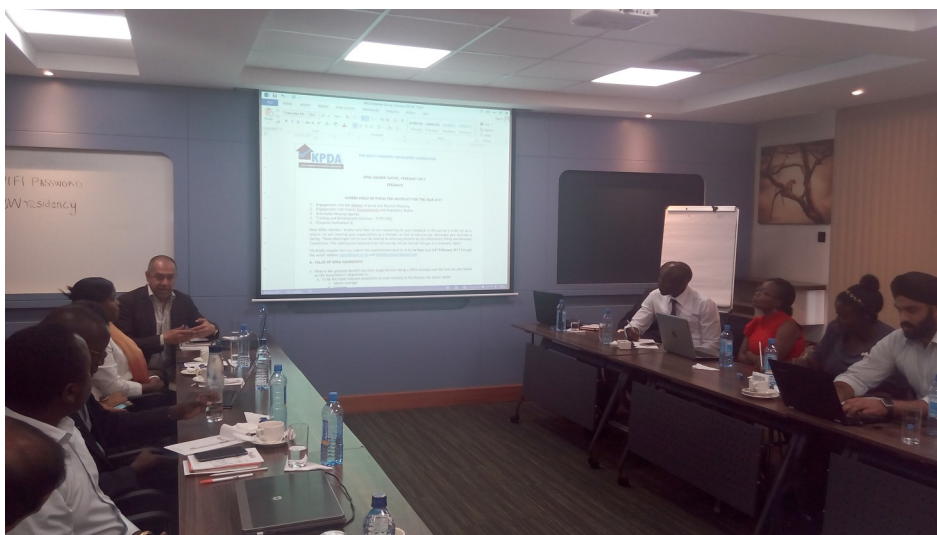
Participants at the KPDA Roundtable Meeting